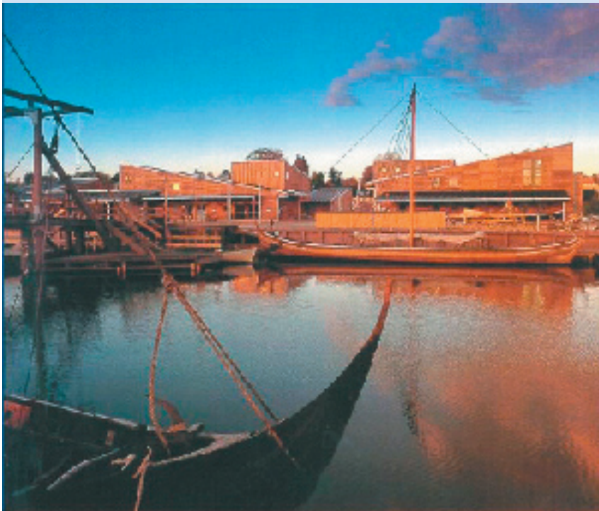
Roskilde Museum Harbour