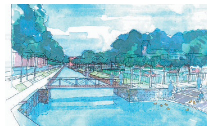
Næstved, uncovering Susåen