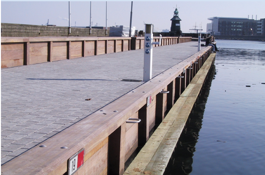
Total Rehabilitation of Hellerup Marina, 2001-2002